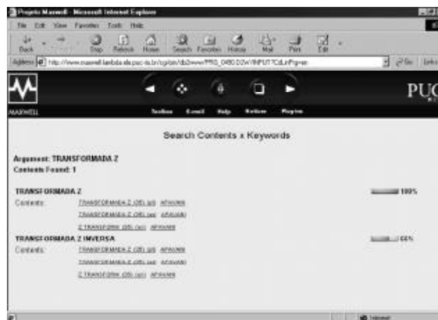
FIGURE4 Retrieved catalog entry – Spanish interface, English cataloging and Portuguese content