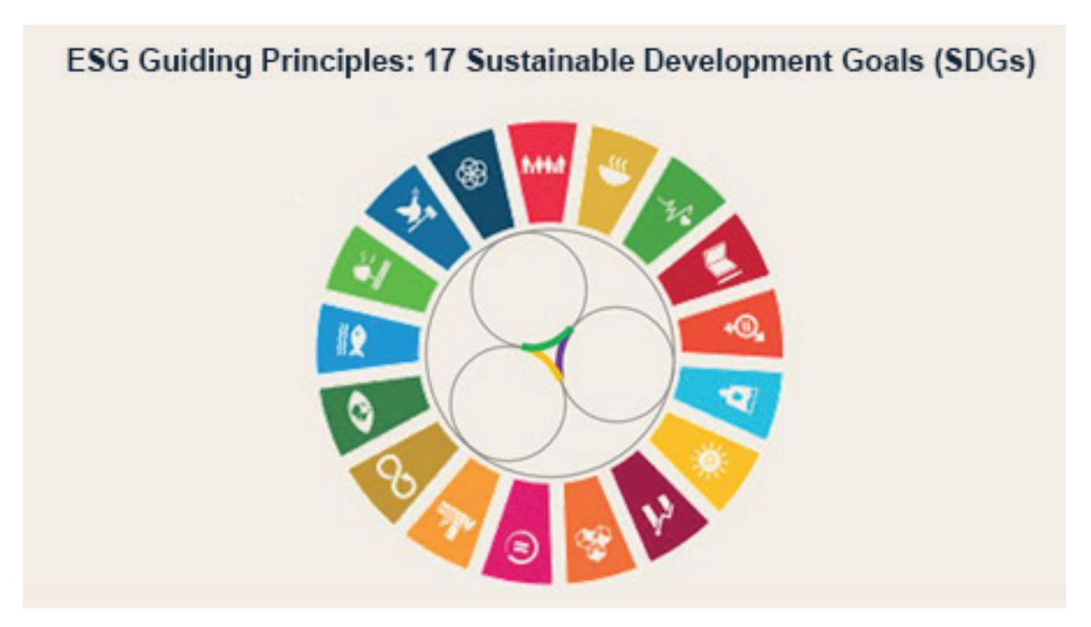
Figure 4 - Guiding Principles of the GRIS Articulator

The GRIS Articulator, grounded in responsibility and social intelligence, plays a pivotal role in weaving together multisectoral collaborations to tackle social and environmental issues on a broader scale, including integrated actions, co-investments, and systemic approaches. Its management model is based on the Middle-up-down approach (Carvalho, 2012) and conscious leadership. In terms of its business model, it adopts servitization (GRIS as a service). Additionally, its guiding principles are aligned with the 17 United Nations Sustainable Development Goals (Figure 4).